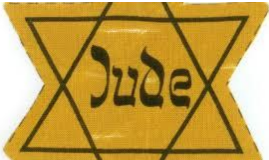
Star of David, worn as identification