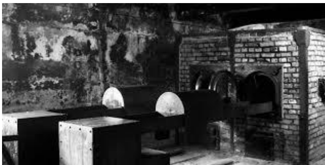
Cremation chamber of Auschwitz