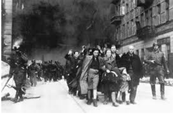
The movement of Jewish people to the Ghettos