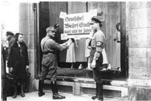
Nazi takeover of Jewish business