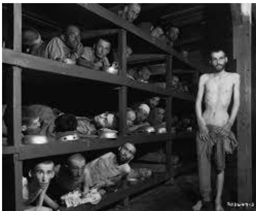
Primary Source G